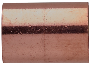
Manicotto femmina con battuta.