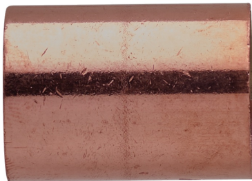
Manicotto femmina con battuta.